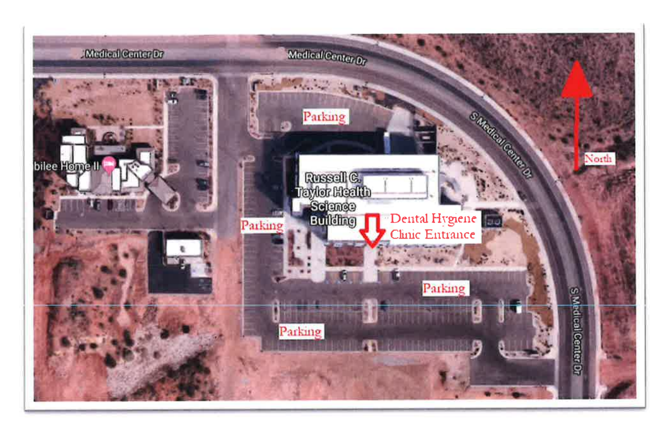
Click on map for larger view.